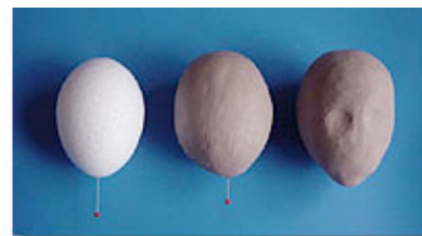
2. The egg, covered and with chin & forehead added