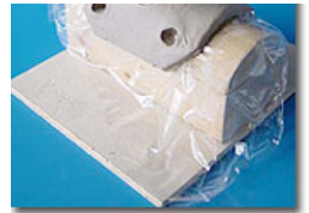
10) the head on the stand

This method of sculpting directly in porcelain has been developed by myself and described in my earlier books and on my CD ( in english) "Handsculpting directly into Porcelain" with text, illustrations, pictures and a complete video demonstration of sculpting into porcelain with further details on this subject, how to paint on porcelain with watercolour and a gallery of Marlaine Verhelst dolls . I have conducted workshops on this subject all over the world.