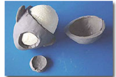
6) cut off the brain pan