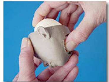
7) push out the egg