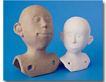
11) Unfired and fired head; same size

This method of sculpting directly in porcelain has been developed by myself and described in my earlier books and on my CD ( in english) "Handsculpting directly into Porcelain" with text, illustrations, pictures and a complete video demonstration of sculpting into porcelain with further details on this subject, how to paint on porcelain with watercolour and a gallery of Marlaine Verhelst dolls . I have conducted workshops on this subject all over the world.