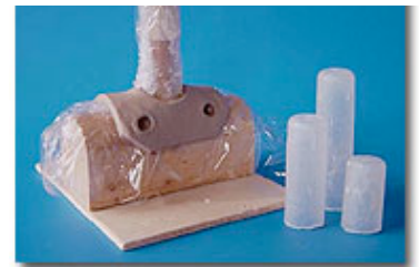
5) prepared stand for breastplate

If the entire piece feels like chocolate (as the head before operating) you can remove it from the stand and work on the inside of the head if necessary.